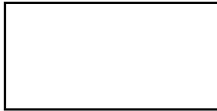
24" x 48"