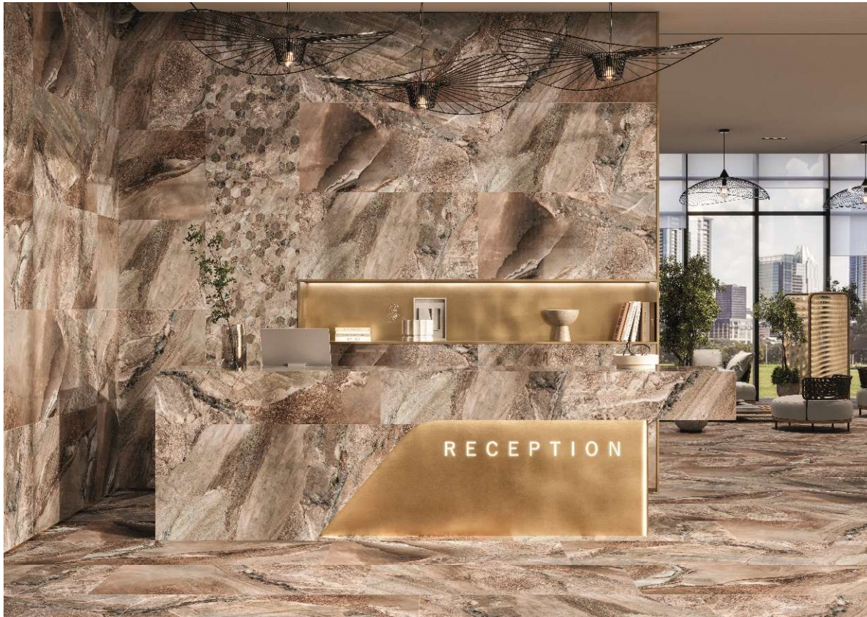
Features Mineral Umber FLO3 Polished 24" x 48"

Beautiful depth, rich colors and a distinct, stone graphic are combined to perfection in the Fossilique Stone Porcelain™ series. Offered in large format field tile sizes, three unforgettable colors and two finishes, Polished and Traction Enhance™ Technology, Fossilique Stone is an ideal series for traditional or contemporary design. A 3" Hexagon mosaic and a trim package that includes a 4" x 12" Bullnose rounds out the series.